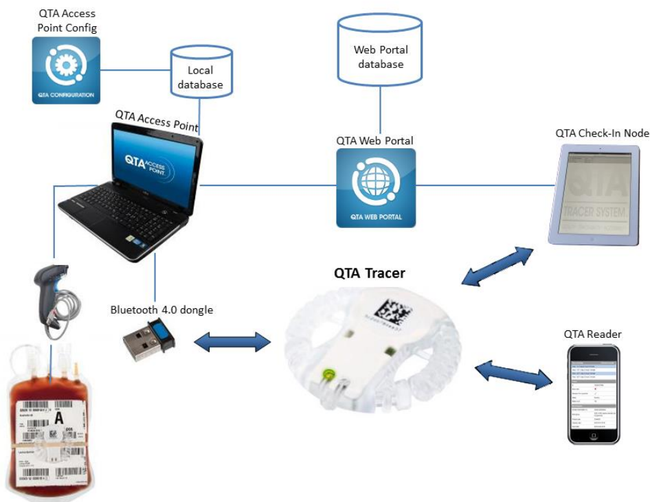
Figure 1. The QTA Tracer System

Figure 1 displays the QTA Tracer system.